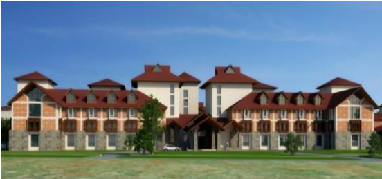
Government Medical College, Anantnag