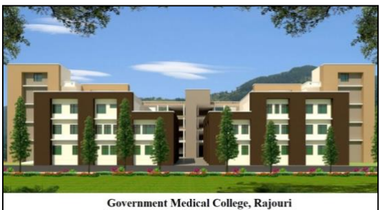
Government Medical College, Rajouri