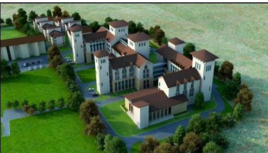
Government Medical College, Baramulla